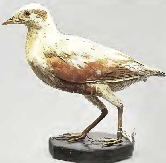
Figure 17. Two specimens of Corn Crane Crex crex showing different stages of progressive greying; top: NHMUK 1939.12.9.3702, below: NHMUK 2004.15.413 (in final stage of progressive greying